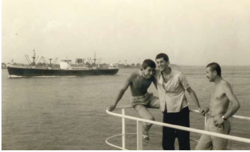
NAMIK KEMAL KÖPRÜ ÜSTÜNDE