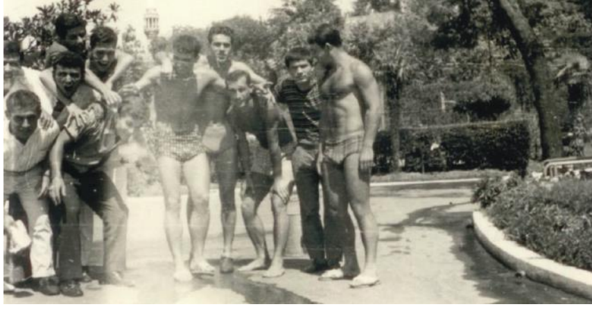
MK 4 VE GV 4 BİRLİKTE - 1965